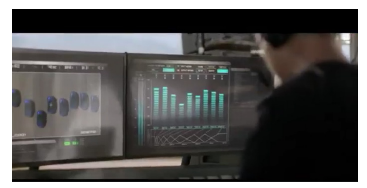
Figure 4. Peugeot 308. Don't Miss a Beat. (still) [EX2]

As the above discussed examples illustrate, by tapping into different semiotic resources, multimodal metaphors target different senses and engage with various modes of communication to better capture attention, trigger emotions and structure meaning-making processes. Different modes of representation and communication help to reach maximum precision and efficacy in the accomplishment of metaphor's potential by providing more versatile semiotic resources.