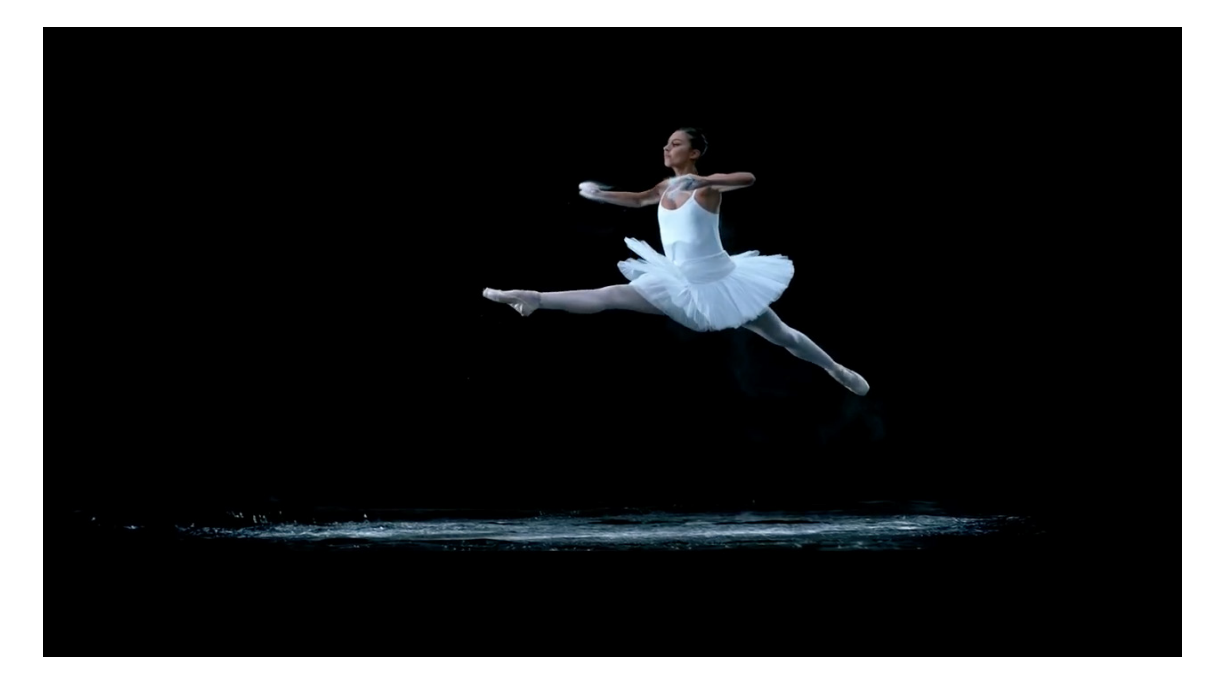
Figure 9. Creative metaphor example (still) [EX19]