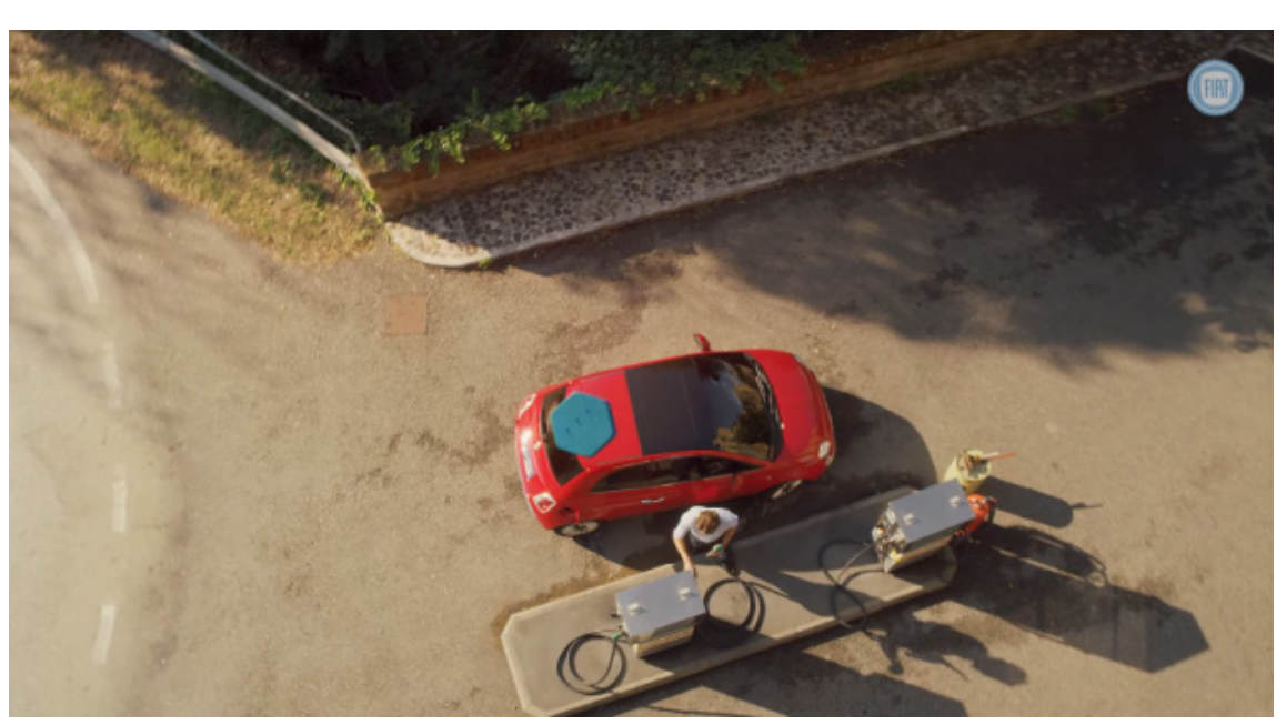
Figure 5. Fiat 500X Super Bowl commercial. "Blue Pill" (still) [EX5]

More recently, Fiat's Super Bowl commercial for the crossover 2015 Fiat 500X, entitled "The Fiat Blue Pill" [EX5] equally taps into the A car is masculine power metaphor.