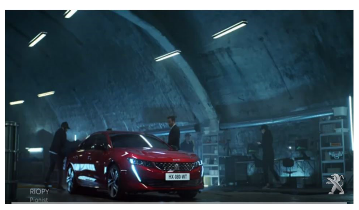
Figure 1. New Peugeot 508 - What Drives You? Opening scene (still 1) [EX1]

To promote its second generation 508 series car released in 2018, Peugeot chose a novel metaphor, namely A car is a musical instrument . By choosing this metaphor a parallel is drawn between the domains of music (in particular, classical music) and driving: the driver is a musician and an artist, driving is musical performance and the car is a musical instrument. The selective projection focuses on features such as precision, harmony and passion. Semiotically speaking, multiple modes are tapped into to draw the parallel between the two domains, such as language (written text and voiceover), visual mode (images, gesture), music and sound.