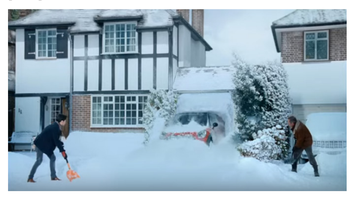
Figure 7. Mini Cooper, Just Snow. 2010 TV commercial (still 2) [EX15]

To conclude, A CAR IS POWER is a conventional metaphor. Its referent has been conventionalised and thereby rendered precise, through the frequent use of this metaphor in the history of car advertising.