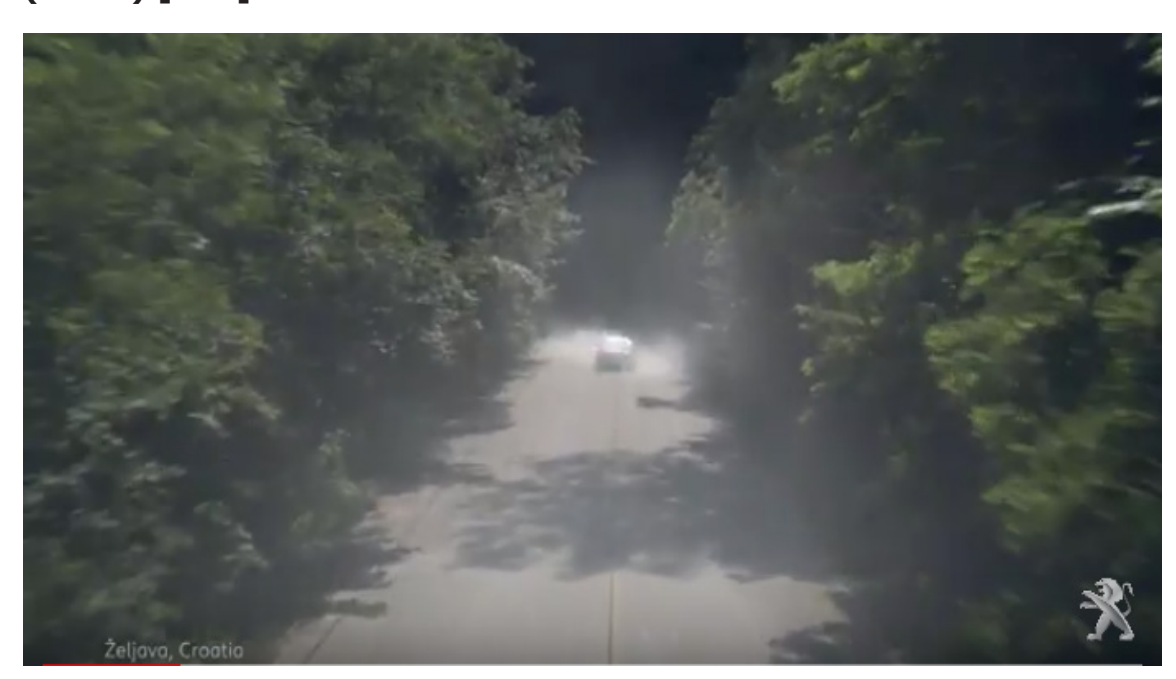
Figure 3. New Peugeot 508 – What Drives you? Green framing (still 3) [EX1]

dynamic classical music. Interestingly, even though this is not a commercial for a green car (e.g. electric or hybrid), the car is pictured amidst dense vegetation, as Figure 3 below shows.