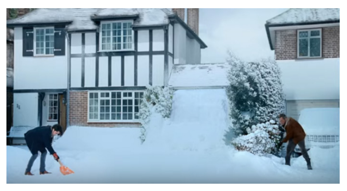
Figure 6. Mini Cooper, Just Snow. 2010 TV commercial (still 1) [EX15]

As the two men featured in the "Just Snow" commercial (2010) [EX15] are trying hard to clean-up their front yards, as can be imagined, to be able to get their cars out (Figure 6), their neighbour, a female driver of Mini Cooper, gets her car out of the garage quite effortlessly (Figure 7). After all, it is "Just Snow", for such a powerful car as the Mini Cooper.