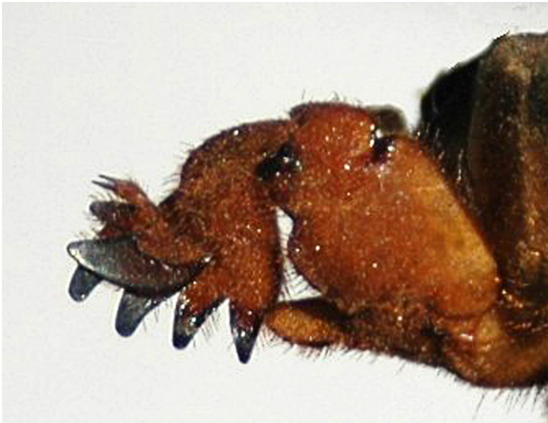
Figure 4. – “Hand” of the mole cricket.