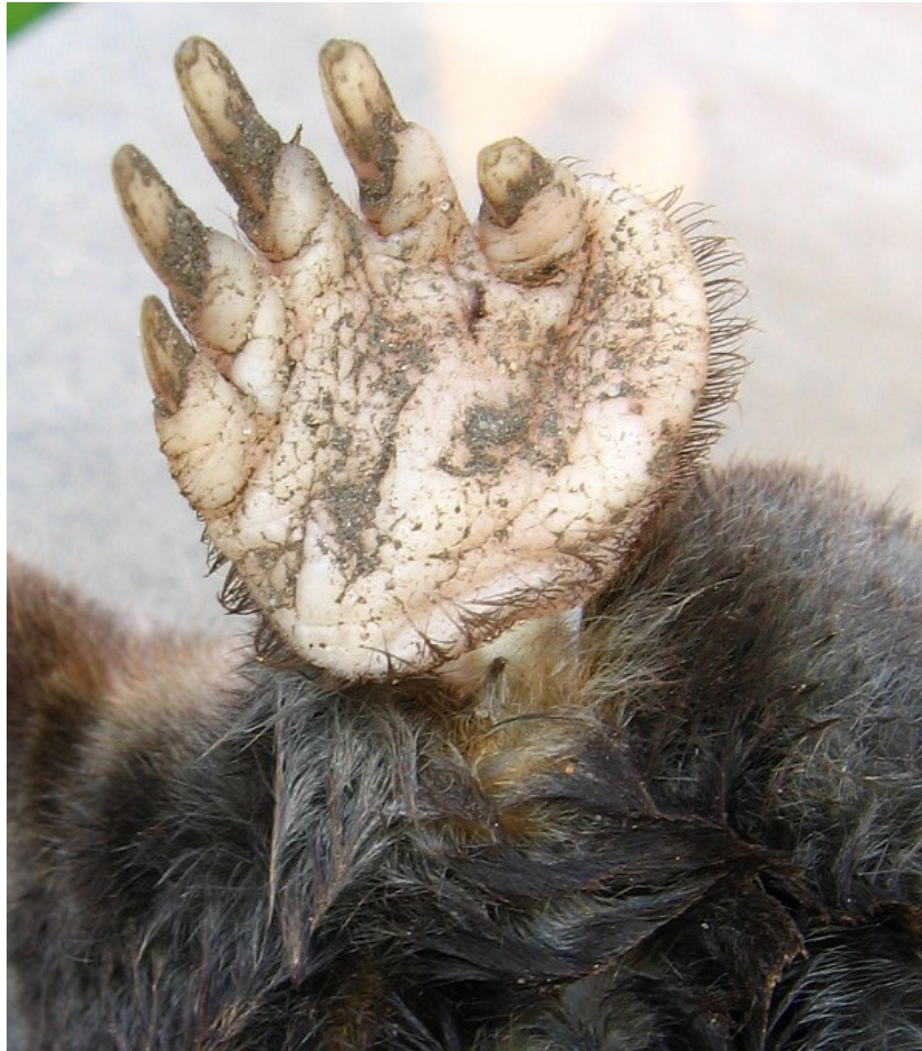
Figure 3. – “Hand” of the mole.