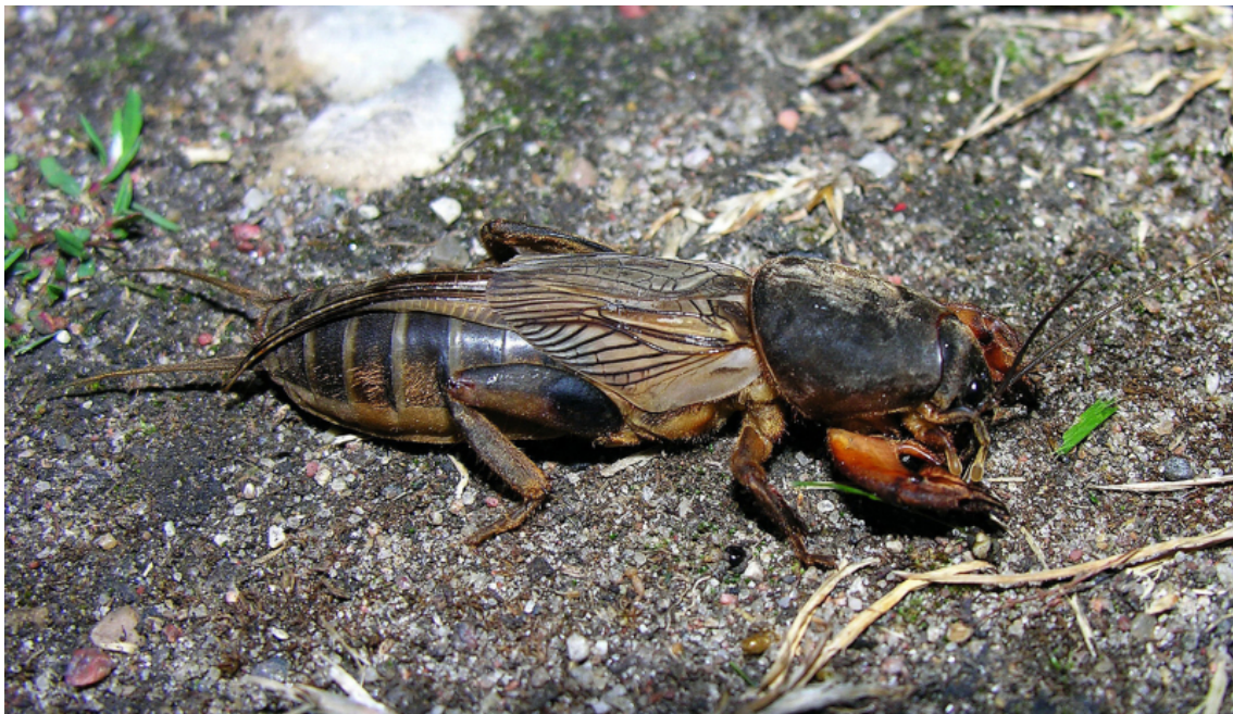
Figure 1. – Mole cricket.