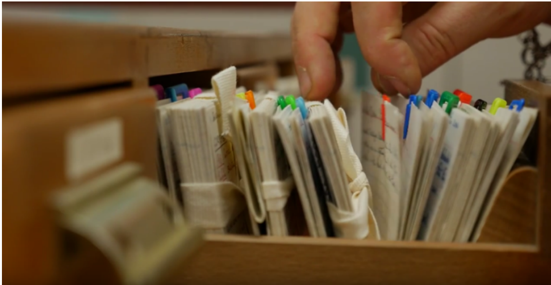
Figure 4. – Film still from Iarsma: Fragments from an Archive , 2014.