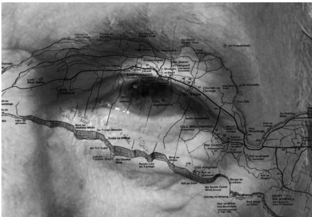
Figure 1. – Artwork from Rianiú Talún: Interpreting Landscape Exhibition .

Designed by Proviz Design, Ireland. 2014. Reproduced with kind permission.