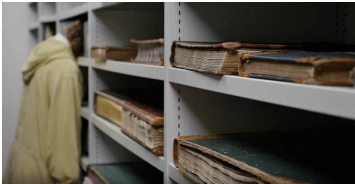
Figure 5. – Film still from Iarsma: Fragments from an Archive , 2014.